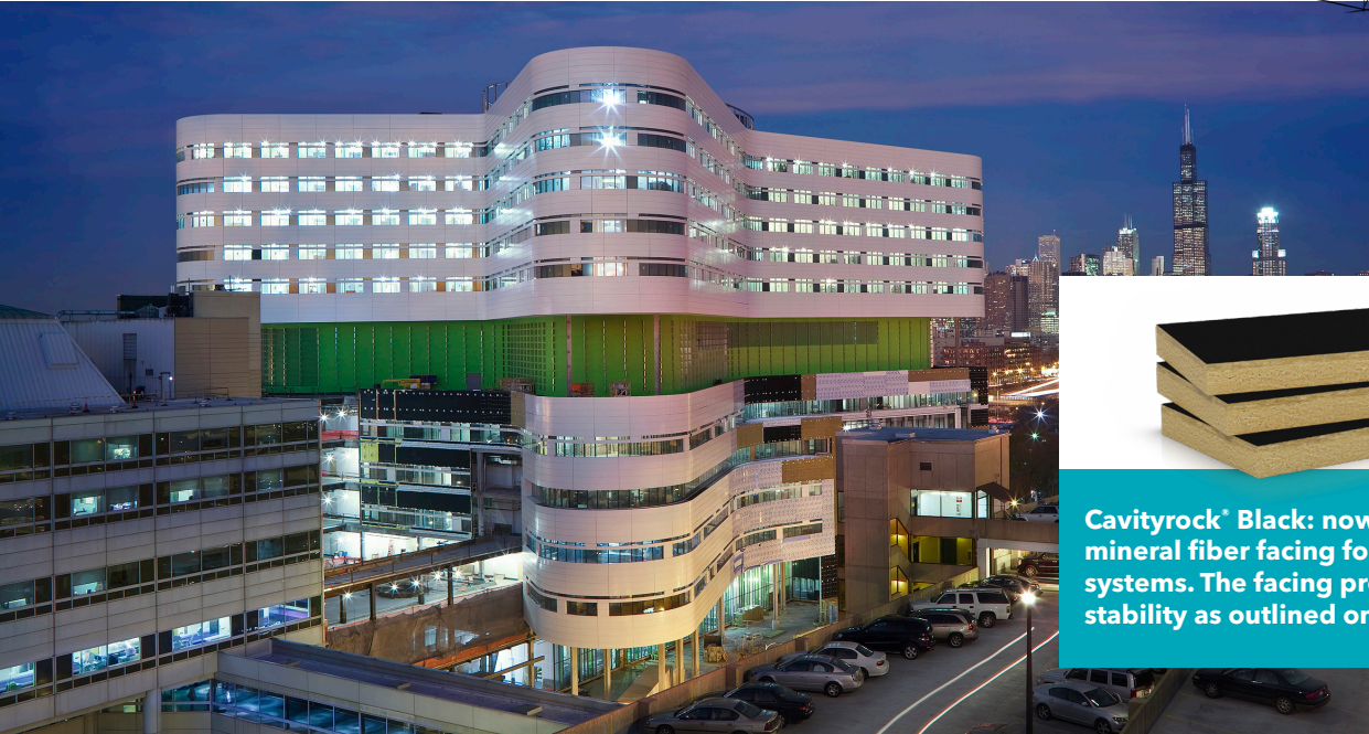
Rush University Medical Center, Chicago, IL