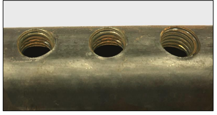
FIGURE 6: Unacceptable Rust in Coupler Threads