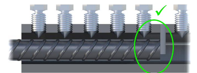
FIGURE 1: Correct Rebar Insertion Depth

Slide the No. 4 through 11 ZAP SCREWLOK " TYPE 2 " coupler over one of the rebar ends until the rebar touches the positive center stop of the coupler, as shown in Figure 1. Do not under-insert, as shown in Figure 2. If the coupler is specially supplied without a center stop, or if the center stop is removed, measure and mark the rebar for one half of the coupler length (L/2) before inserting it into the coupler per Figure 3 and Chart 1.