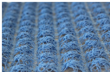
Mortairvent® (.40 in. / 10mm)