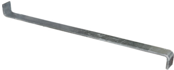
Shear Wall Conditions